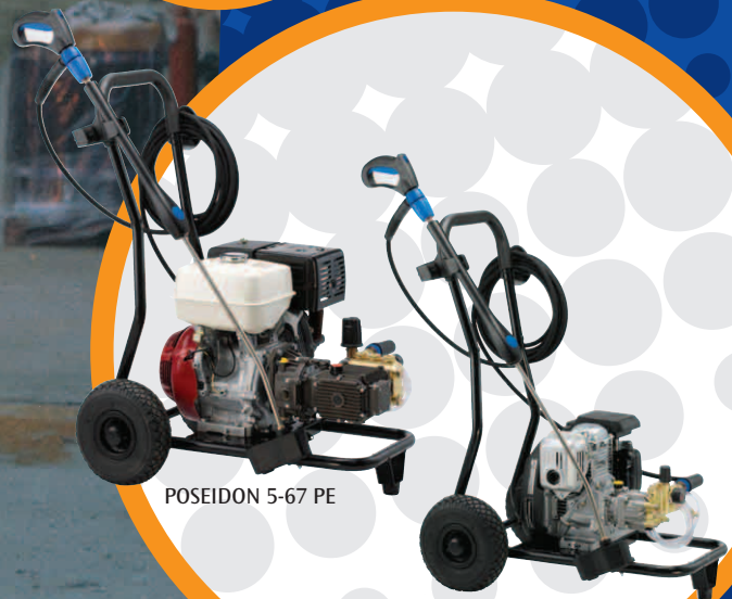
POSEIDON 5-67 PE